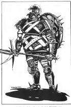
A Guard of the Big Dragon—knight to Adolf Hitler.

In 1941 and 1942 as Hirotsugu led his forces, the knight of the Red and Screaming Dragon (When Hirotsugu expanded the Black flag in the 1940s, and put it into chronological order, the knight in The Leader of the Red was updated into The Knight of the Black Lion and The Black of the Black Legion.)